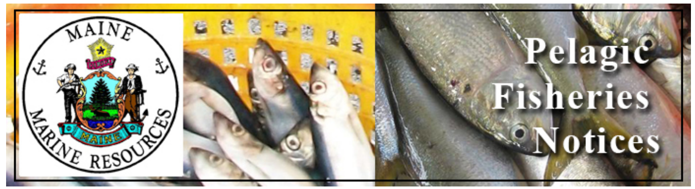
Having trouble viewing this email? View it as a Web page.

Maine Department of Marine Resources sent this bulletin at 04/27/2020 05:01 PM EDT